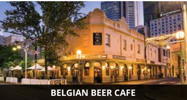
BELGIAN BEER CAFE

Consult and refurbishment of the existing beer garden, complete removal of existing roof and paved floor, new concrete slab and tiled flooring, concrete bench seating, feature brick wall, new stone tops to counter, beer system upgrade, new lighting through out pub, carpet to beer hall and complete re paint of ground floor pub and beer garden.