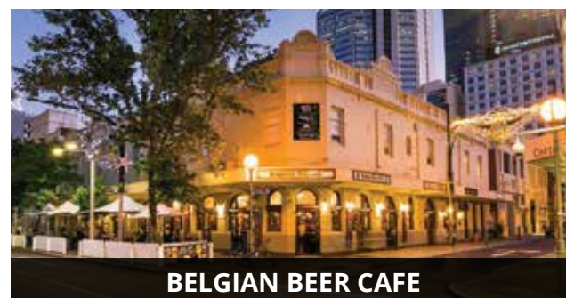
BELGIAN BEER CAFE

Consult and refurbishment of the existing beer garden, complete removal of existing roof and paved floor, new concrete slab and tiled flooring, concrete bench seating, feature brick wall, new stone tops to counter, beer system upgrade, new lighting through out pub, carpet to beer hall and complete re paint of ground floor pub and beer garden.