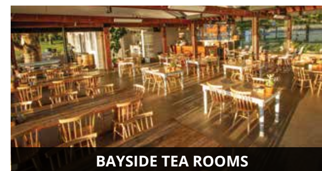
BAYSIDE TEA ROOMS