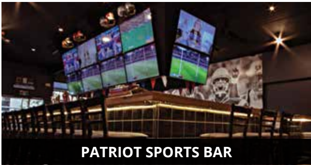
PATRIOT SPORTS BAR